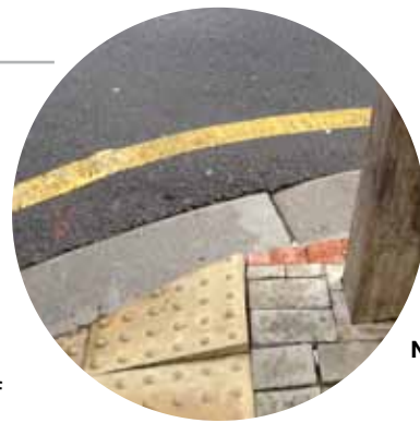
A loose paving stone which caused serious injury to a 90-year-old resident last November

Costs to the Council around roads and pavements arise mainly from insurance claims by drivers relating to potholes in the carriageway rather than by