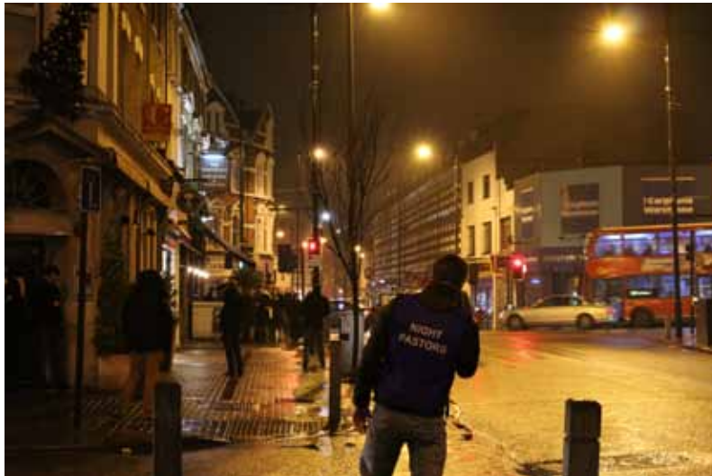
Saturday night at the Junction, and the Night Pastors are out offering a helping hand to clubbers.

While the riots certainly provided a catalyst for wanting to do something to help make Clapham Junction a safer place at night, night pastors is far from a knee-jerk, short-lived