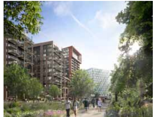
above left Nine Elms: before start of the development , above right Proposed view towards US Embassy from Embassy Gardens

also start being built and will open on Independence Day, 4 July 2017.