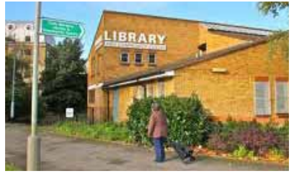
York Gardens Library

There is no doubt that savings have to be made. Due to the funding cuts, over the last two years hundreds of public library jobs have been lost countrywide, opening hours have been shortened and 10% of local authorities have closed libraries. In London, Camden, Brent, Barking and Barnet have all closed libraries and many more are under threat across the country.