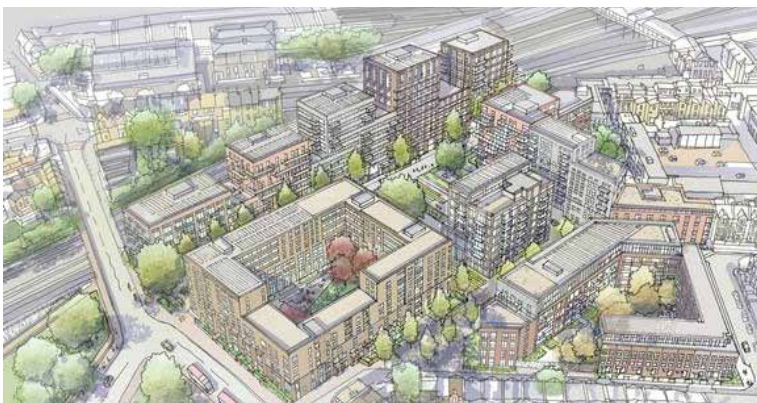
Plans for the new Peabody development, seen from the south

When the Peabody development came to Wandsworth's planning committee (where it was approved), the developer had made some amendments to the design of buildings and public spaces in response to the design panel's comments. It is to be hoped that this will help result in an estate that all of us – residents and non-residents – will be happy to walk through.