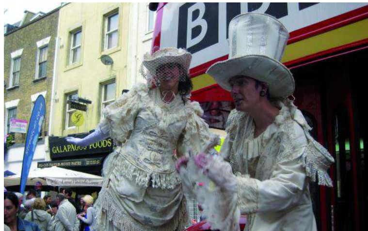
Battersea High Street put out the flags on 29 April. Full story on on back page