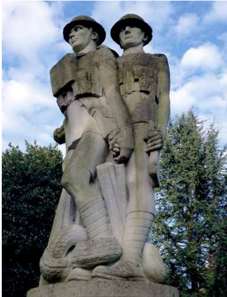
The striking sculpture by Eric Kennington in Battersea Park

Kennington made the sculpture in his Thames-side Chiswick studio