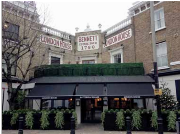
The London House: The Battersea Four dined out in style

The most arresting of the starters was a braised pig's head croquette with quail eggs, pickled carrot and caper mayonnaise. As our dentist companion from Dorset remarked, it is hard to recognise a pig's head 'sans teeth sans eyes sans everything', but the very juicy meat inside the two bread-crumbed patties was certainly