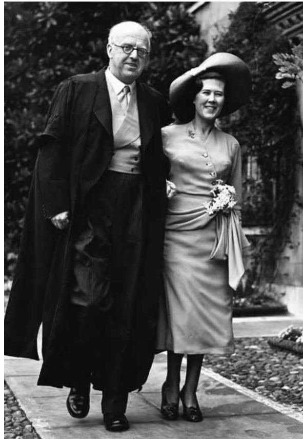
Pamela Hansford Johnson marries C P Snow in 1950