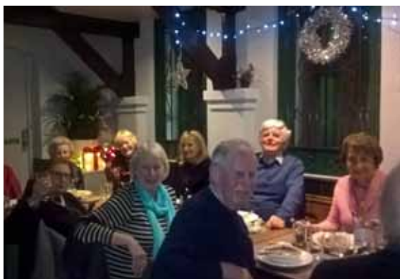
Over 20 members of the Battersea Society celebrated Twelfth Night on 6 January at the traditional supper at Antipasto on Battersea Park Road.