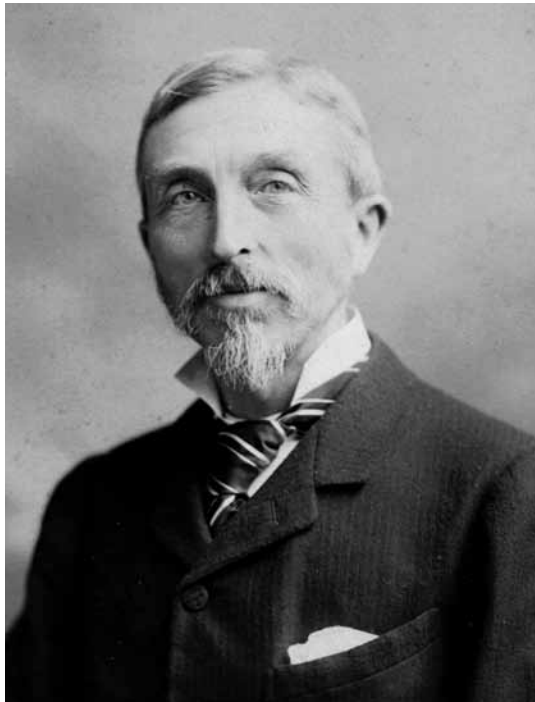
Charles Booth, 1840 – 1916

By the time the maps were drawn, the marshes and market gardens surrounding Battersea Village were a distant memory. When the Wandsworth District Board of Works was created in 1856 covering Battersea, Clapham, Putney,