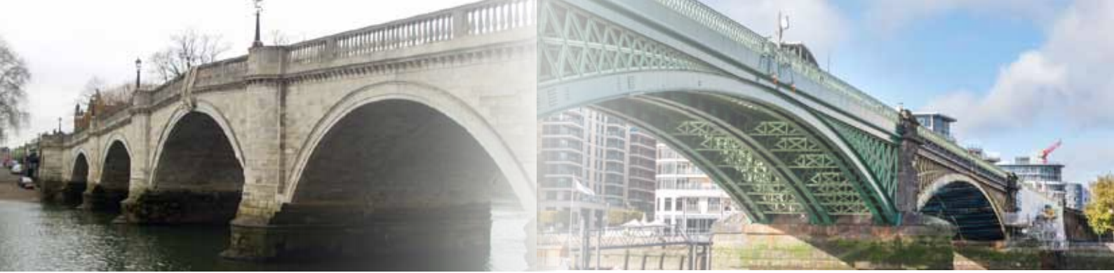
River boroughs: Richmond Bridge and Chelsea Railway Bridge to Battersea