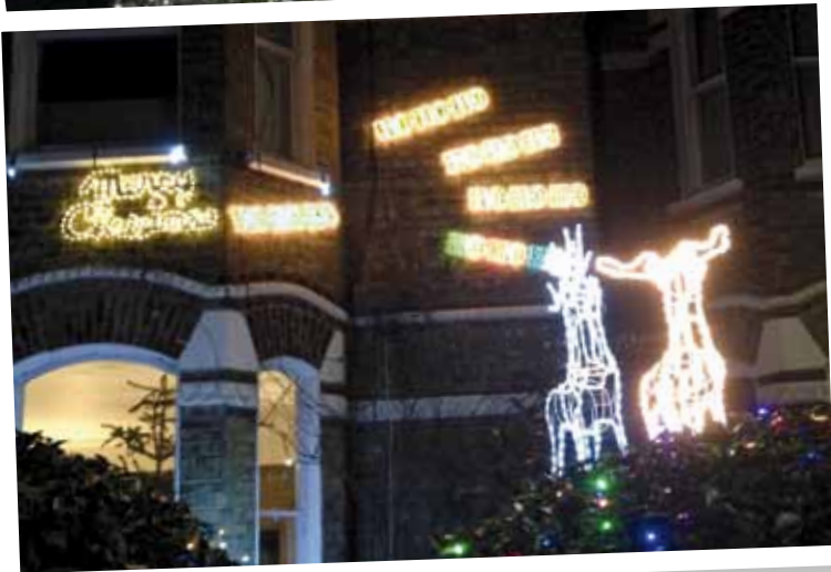
Battersea went wonderfully bonkers this Christmas with glamour and tradition in Spencer Park, moody blues and the full Monty in Bolingbroke Grove