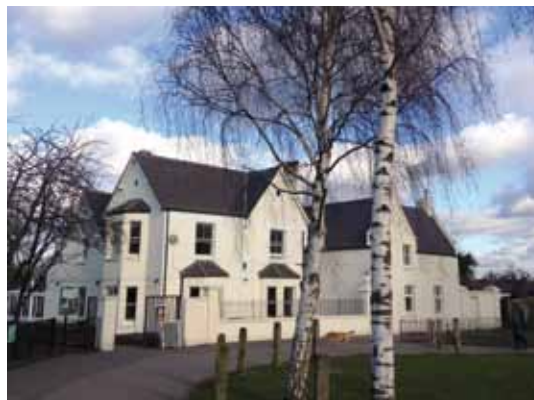
Neals Lodge: thin end of the wedge?

Without going into too much detailed legalese, the basis of the challenge was that the use of common land for a commercial venture which had exclusive use of the premises, fell outside the powers of the council under legislation governing the use of the common. The judgement may be viewed on line at ( www.bailii.org/ew/cases/EWHC/Admin/2017/1947.html ) but the gist